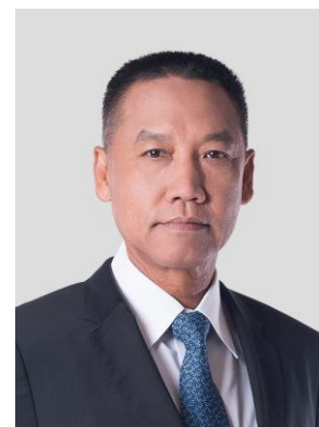
Elected as Independent Director