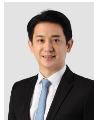
Elected as Director